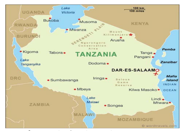
Map of Tanzania showing regions

The selected Team of 40 facilitators who are science teachers from different parts of the country and other invited academicians from University of Dar es salaam has been facilitated on CRC concepts as well as CRC articles